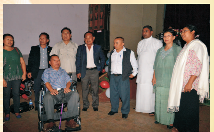
Wheelchairs Distribution at Kohima District on 24-08-13 Distributed By Shri Kiyanielie Peseyie, Minister for Social Welfare. Nagaland